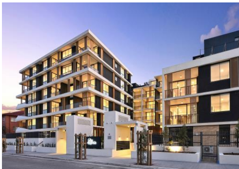
Ryde SDA Apartments, New South Wales