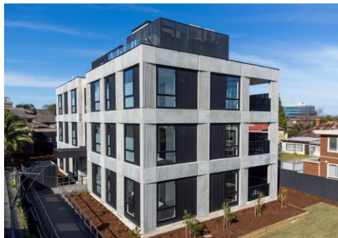
Dandenong SDA Apartments, Victoria