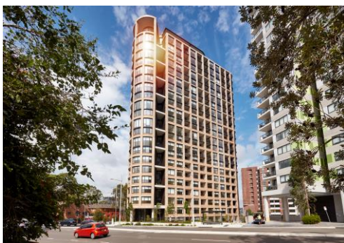
Macquarie Park SDA Apartments, New South Wales