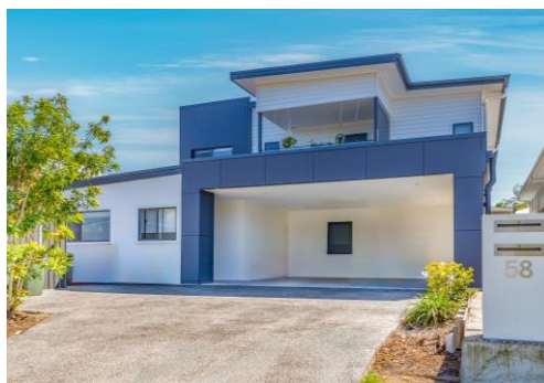
Cannon Hill SDA Apartments, Queensland