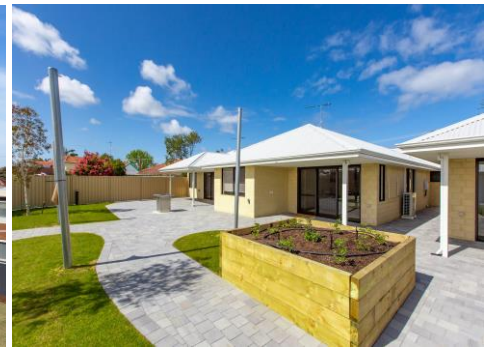
South Bunbury SDA House / Villas, Western Australia