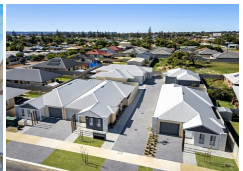
Geraldton SDA House / Villas, Western Australia