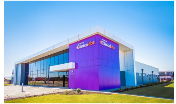
Clinical Labs Pathology Laboratory, South Australia